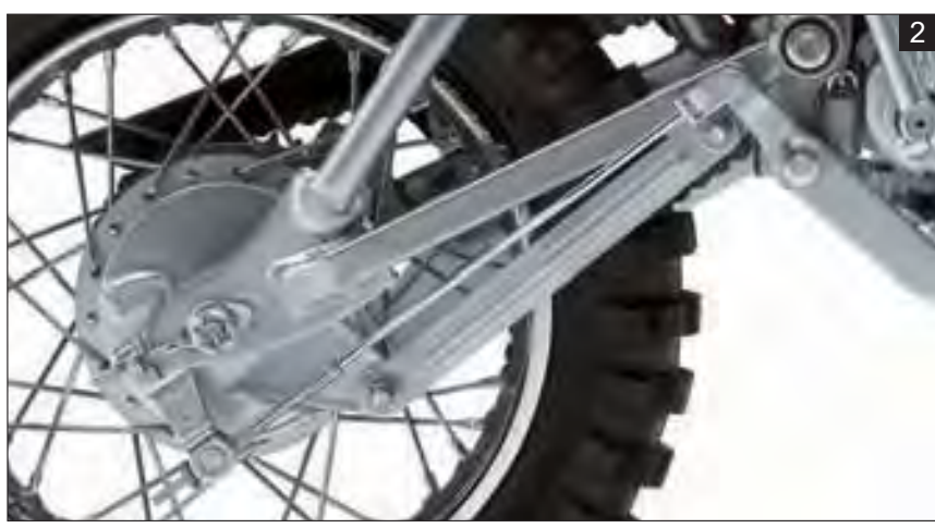
*KLX110R L shown - non-current image