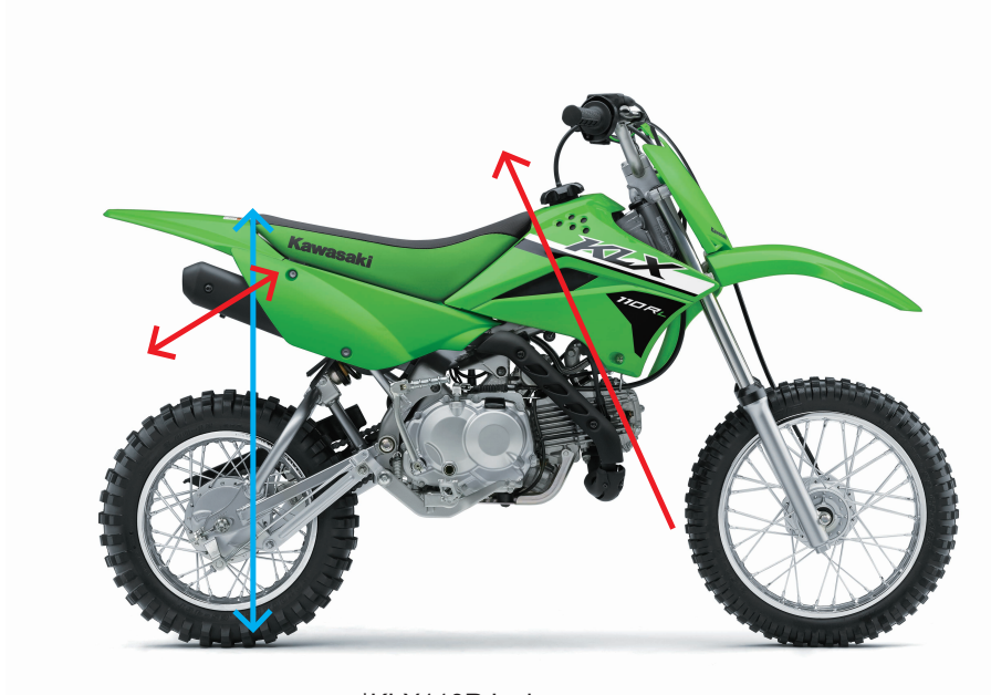
*KLX110R L shown