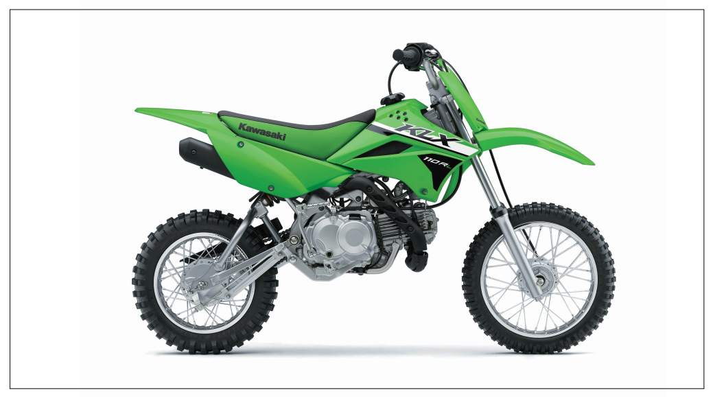
*KLX110R L shown