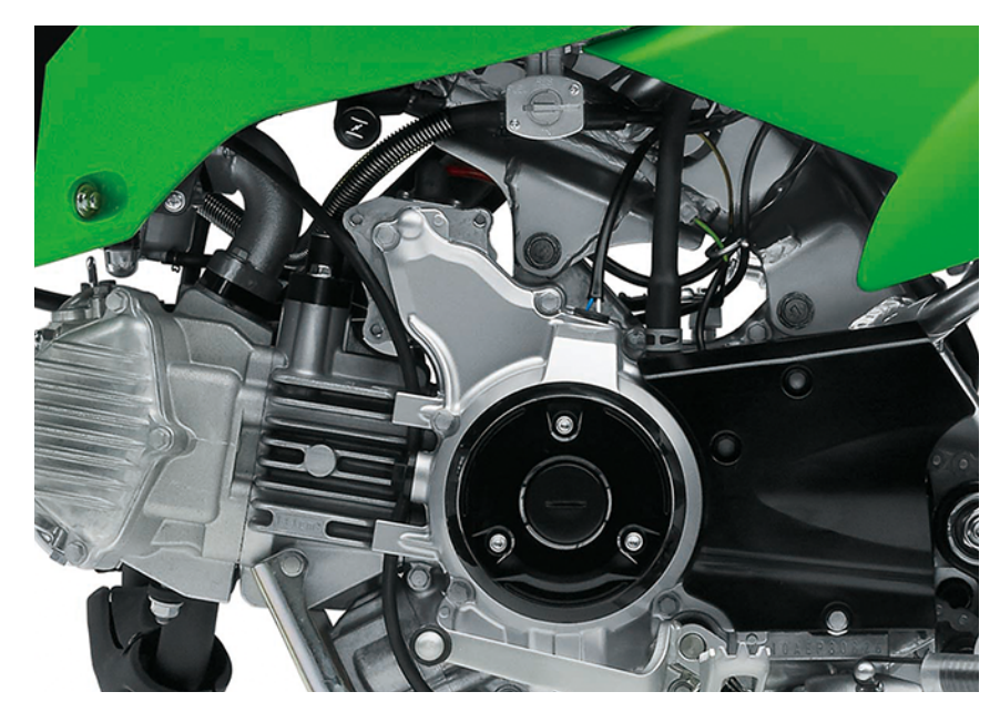
*KLX110R L shown