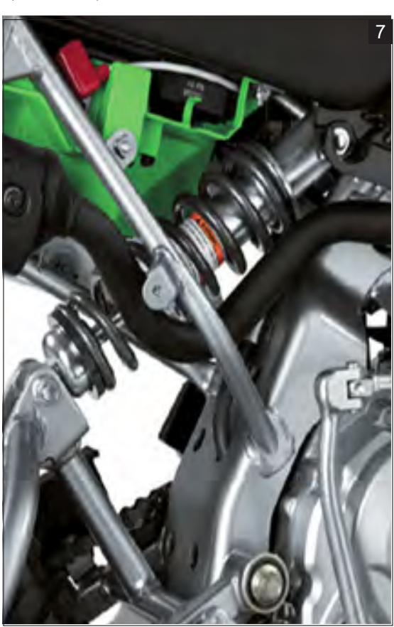
*KLX110R L shown - non-current image