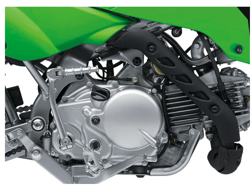
*KLX110R L shown