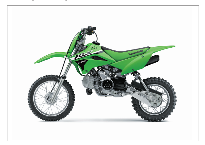
Lime Green - GN1