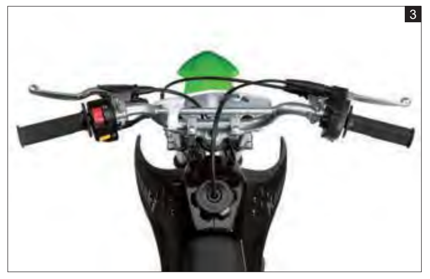
*KLX110R L shown - non-current image