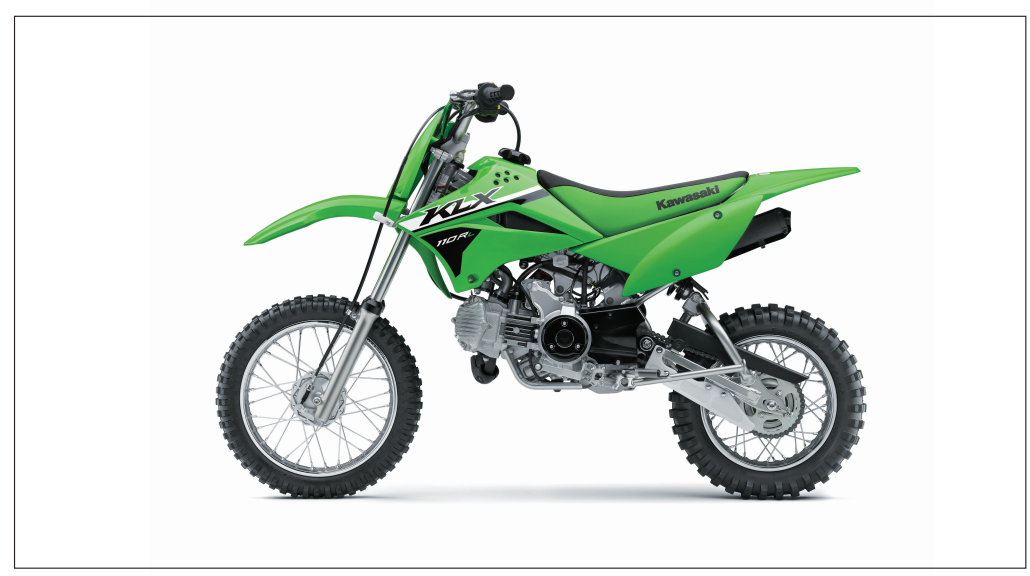
*KLX110R L shown

Compounding the fun, riders have two models to choose from. The KLX110R comes equipped with a centrifugal clutch, enabling clutchless shifting.