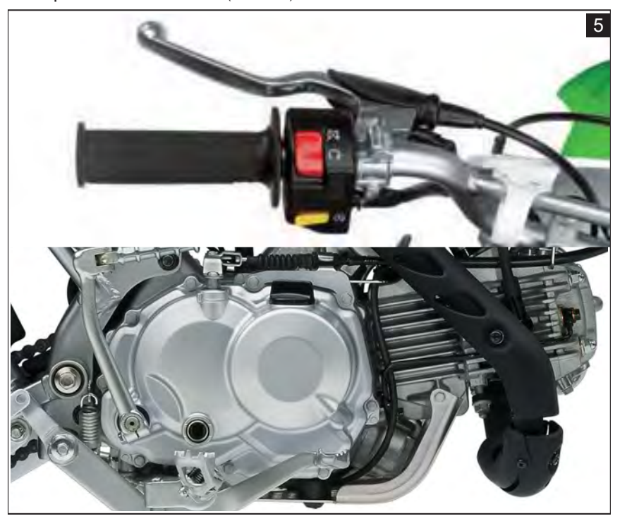
*KLX110R L Shown

* Manual clutch (KLX110R L only) offers the rider additional control. Gear pattern is 1-N-2-3-4. (Photo 5)