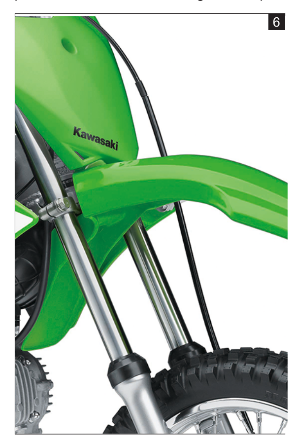
*KLX110R L shown

* The longer suspension of the KLX110R L also offers increased handling performance and increased rough-road capability. (Photos 6-7)